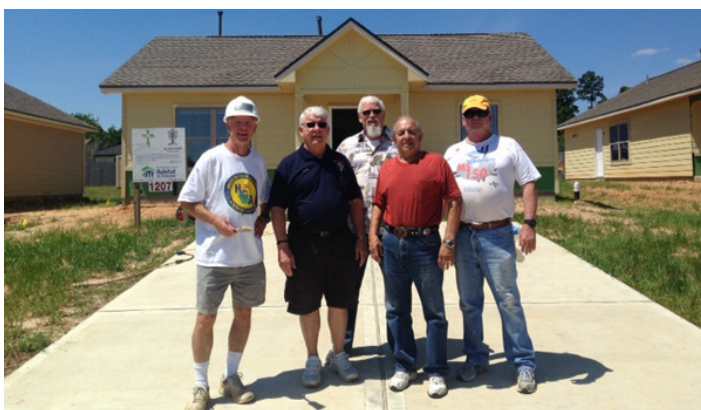
Habitat for Humanity Build

We are looking for a knight to be the Chairman of the Family Committee. Responsibilities include gathering info on all the young families and getting info to them about family nights and programs. If you have a family or know a family, let this be your big start. Keep track of events so you can get our families together and grow our council family. Kids love doing stuff where other kids are doing stuff.