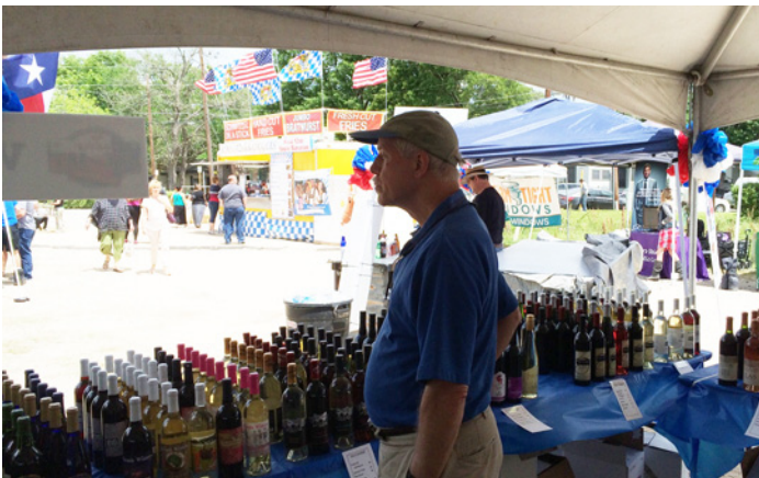
Spring Winefest 2016