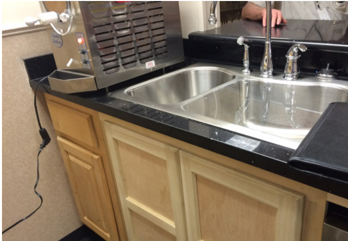
New Cabinets at the Hall