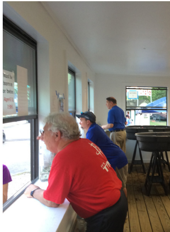
Beer Booth Crawfish Festival 2016